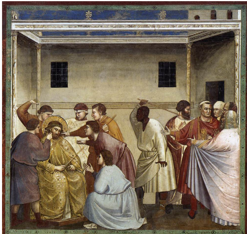
The Flagellation by Giotto, c. 1305.

UNDER THY patronage we fly, O Holy Mother of God: Reject not our prayers We send up to thee in our necessities, But ever deliver us In time of peril, O Virgin glorious and blessed.